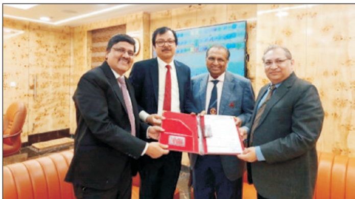
Exchange of LOA