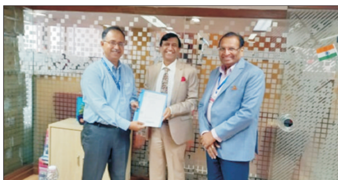
Exchange of MoU