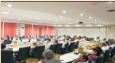
VIEW OF MEETING

An Extraordinary General Meeting of the Members of Mahavir International was convened on Sunday, 19th March,2017 at PHD Chamber of Commerce and Industry, August Kranti Marg, New Delhi to pass and approve on the proposed amendments in the Memorandum of Association of Mahavir International Delhi proposed with or without modifications.