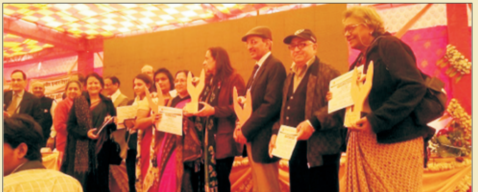
Team of MID