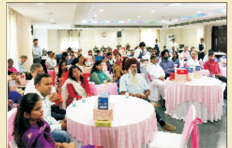
View of Get together