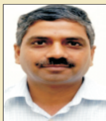
SH. AJAY CHOUDHARY, IPS OSD to laftent/general governor of delhi