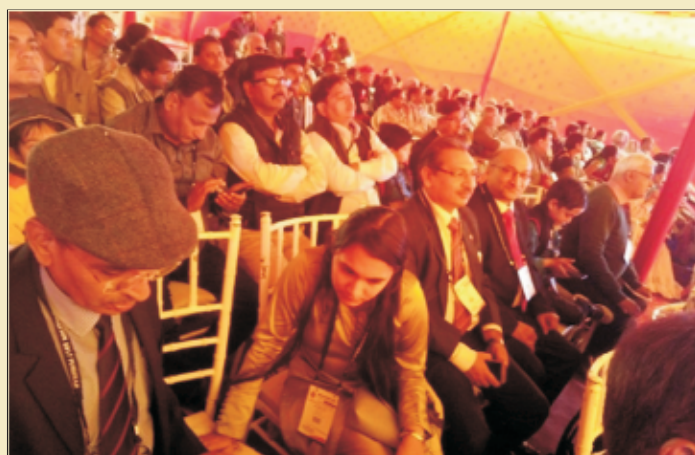
View of Convention

A stall was also organized through which the literature, our Monthly Magazines, Souvenir etc depicting the activities of our centre were also distributed to create more awareness about our centre. The same was appreciated by the attendees which was evident from the numbers of Members who visited & inquired at the stall.