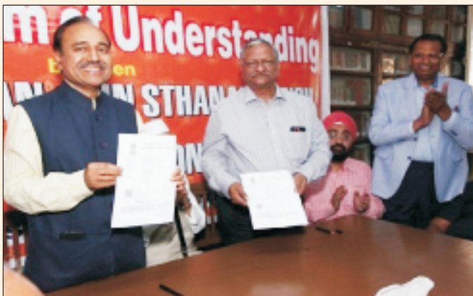
Exchange of MOU