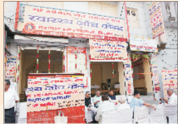
View of dispensary