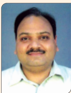
Shri Ravi Jain, IRS Commissioner of Income Tax