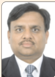
SH. SUKESH JAIN, IRS Commissioner of Income Tax (Systems)